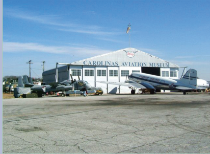
Carolinas Aviation Museum located at Charlotte-Douglas International Airport